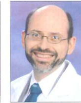
Dr. Michael Greger